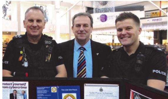
PCC with officers from TV's Police Interceptors at a crime prevention event in Hartlepool.

The Plan contains over 50 commitments which will enable these objectives to be met and the Plan's clear outcomes to be achieved. As your elected representative, I hold the Chief Constable to account for delivering the policing and community safety aspects of it.