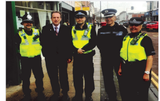
PCC and Chief Constable with neighbourhood officers in North Ormesby.

I believe neighbourhood policing is the foundation that underpins all our objectives. Whilst the cuts we have faced in recent years - £39m or 36% since 2010 - makes delivery more challenging than ever, the Chief Constable and I remain committed to neighbourhood policing. I know this is the aspect of policing residents value most and want to see retained.