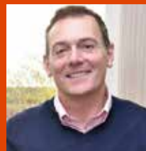
Mayor Andy Preston (Middlesbrough)