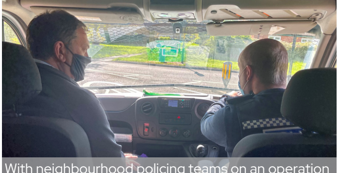
With neighbourhood policing teams on an operation

Operations such as this are visible and the public can see them happening, building confidence to report concerns and resulting in safer communities.