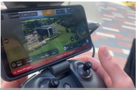
A demonstration by Cleveland Police's drone unit