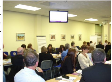
Partnership event to consult on Police and Crime Plan and precept

Ensuring I make the best use of resources is vital for delivering my objectives and supporting the work of the Chief Constable and the wider criminal justice partners. Reducing crime and antisocial behaviour cannot be delivered by a single organisation. It is about working smarter together. An example of this is building on the excellent 'Street Triage' service which has been recognised and highlighted by the Home Secretary as 'best work on the ground' for protecting those suffering with mental health problems. Additional work includes developing a new commissioning framework. First steps are: