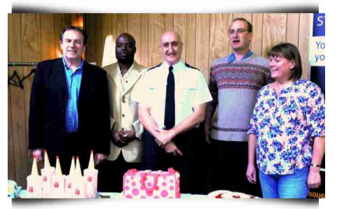
Asylum seekers engagement