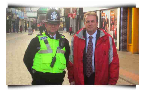
Town centre partnership