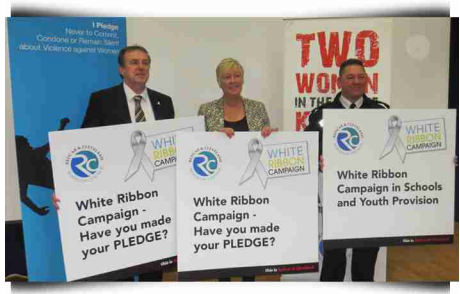
Launch of White Ribbon Campaign