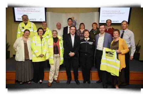
Thank you to Street Angels