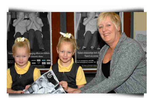
Protecting domestic violence victims