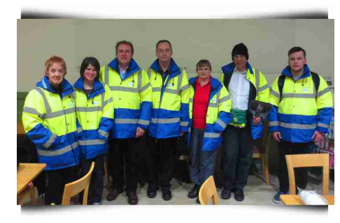
Helping out with the Boro Angels