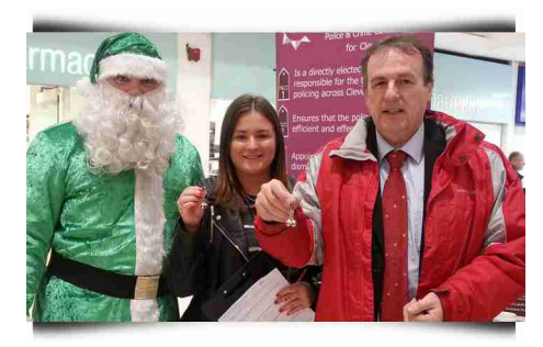
Consultation at Christmas