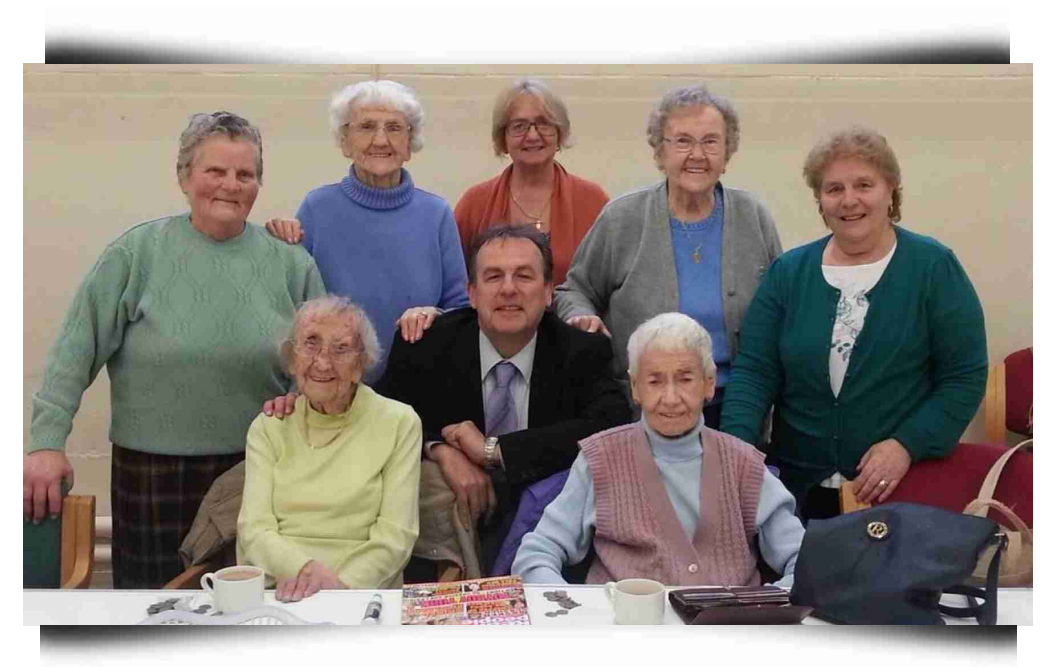
Meeting an elderly residents' group at North Ormesby

The Police & Crime Plan is a concise working document, reviewed and revised annually, that sets out the overall work plan for me and my office. It is based on the five priorities I was elected on in November 2012. Overall, there are 30 areas of work I have completed during the last year, plus more than 50 for the period to come. The Plan is supported by the Chief Constable and thus gives strategic direction to Cleveland Police.