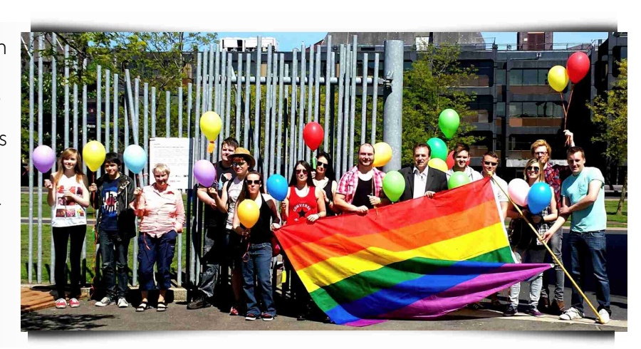
Supporting International Day Against Homophobia

Victims are important to everything we do in Cleveland. Crime and antisocial behaviour have a big impact on lives and communities. I am actively consulting regarding victim and witness needs to help improve local services so individuals can cope and recover from crime and be supported through the investigation and trial processes. In October 2014, I took on new responsibilities to commission further services for victims and witnesses of crime. From April 2015 I will commission victim referral services and specialist support based on local need.