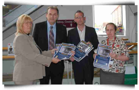
Tackling disability hate crime