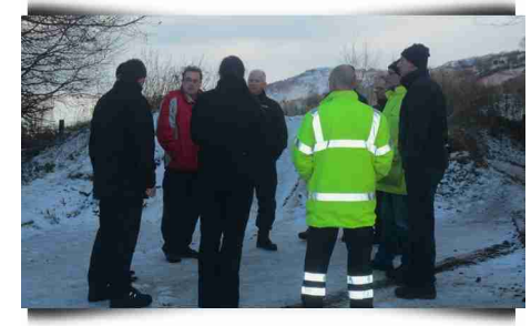
Rural crime prevention