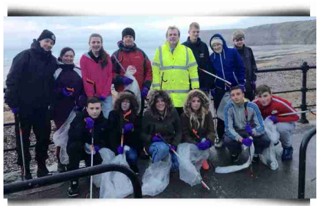
Cadets' beach clean