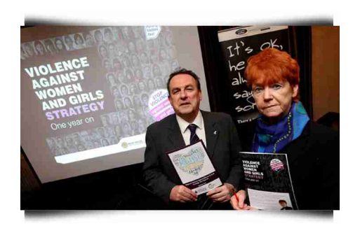
Violence Against Women & Girls Strategy - one year on