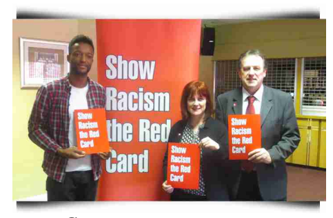
Saying no to racism