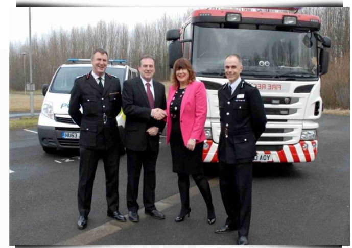
Collaboration agreed with the Fire Service

We all have a shared interest in community safety and improving quality of services. Reductions in crime and antisocial behaviour cannot be delivered by a single organisation and future services are likely to be provided through pooling of resources, collaboration agreements and shared buildings. We have strong partnerships with local communities, agencies and the voluntary sector, successfully developing services and initiatives to tackle local crime. Opportunities for collaboration and shared working arrangements are being fully explored with colleagues from 'blue light' and other services, neighbouring police forces and through regional cooperation between PCCs.