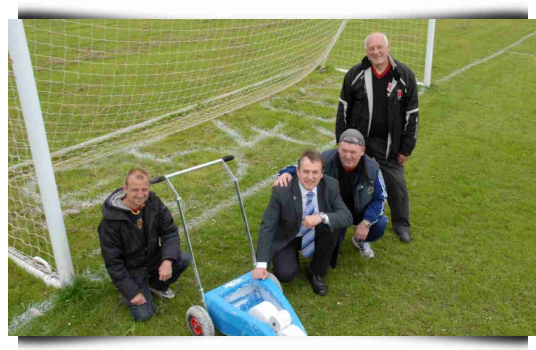
Supporting local community groups

I want Cleveland to be a safe and tolerant place and to work with communities in the pursuit of this. Cleveland has a greatly improving police service and I am determined to keep it that way. We have sound medium term financial plans, as endorsed by Her Majesty's Inspectorate of Constabulary and, as part of that, we are recruiting police officers and specials, and extending the police cadet services. People are our greatest asset and I will seek to achieve fairness for all our staff.