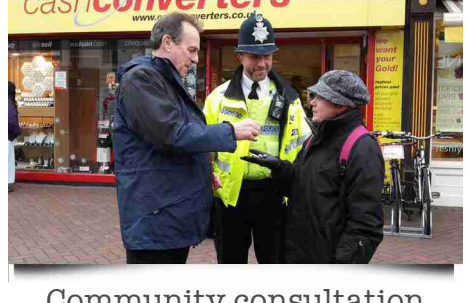
Community consultation in Redcar