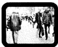
KEEPING OUR COMMUNITIES SAFE