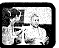
PUTTING VICTIMS AT THE HEART OF THE CRIMINAL JUSTICE SYSTEM

The APCC is a transparent organisation and complies with the new Data Protection Regulations. More information about the sort of personal data we hold, our purpose and lawful basis for doing so and who we share personal information with can be found in our privacy statement here . The GDPR gives you new rights about what happens to your personal data and you have the right to object to us processing your personal information. Information on how to do this is included in our privacy statement.