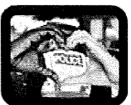
TACKLING RACE DISPARITY IN POLICING