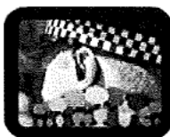
THE PUBLIC'S VOICE IN POLICING