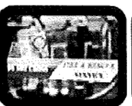
PFCCs DELIVERING EFFECTIVE, ACCOUNTABLE FIRE & RESCUE SERVICES