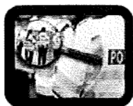
HOLDING THE POLICE TO ACCOUNT